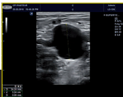
Fig. 1a: Left femoral vein phlebectasia in cross section in B mode.