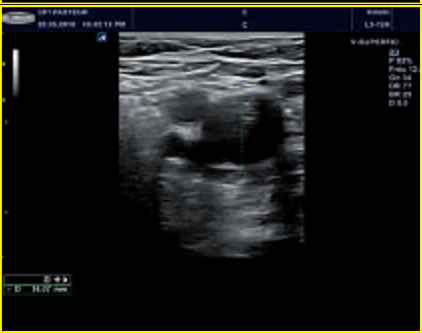
Fig. 1d: Measurement of the antero- posterior diameter of the contralateral common femoral vein.