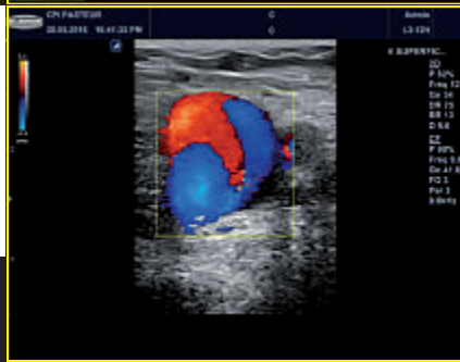
Fig. 1c: Colour Doppler cross section: absence of wall thrombus.