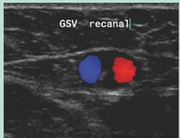
FIGURE 4 : Duplex ultrasound of the great saphenous vein 10 cm under the saphenofemoral junction (transverse image). Recanalisation with 2 tortuous channels 3 years after endovenous laser ablation.

This means that after an intervention, other previously unaffected superficial veins or perforating veins may become incompetent and truncal reflux may extend to a previously competent segment.