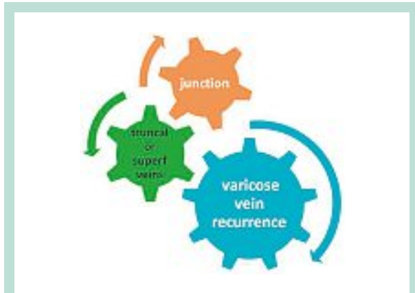
FIGURE 5 : Joint venture between phenomena at the saphenofemoral or saphenopopliteal junction and truncal or superficial veins in the periphery may lead to clinically relevant varicose vein recurrence.