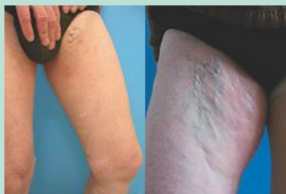
FIGURE 1 : Similar clinical appearance of recurrence 5 years after surgery (left) and 5 years after endovenous laser ablation (right).

According to the 3-year results after treatment with radiofrequency powered segmental ablation (Closure Fast®), the incidence of recurrent varicose veins was 33% [4].