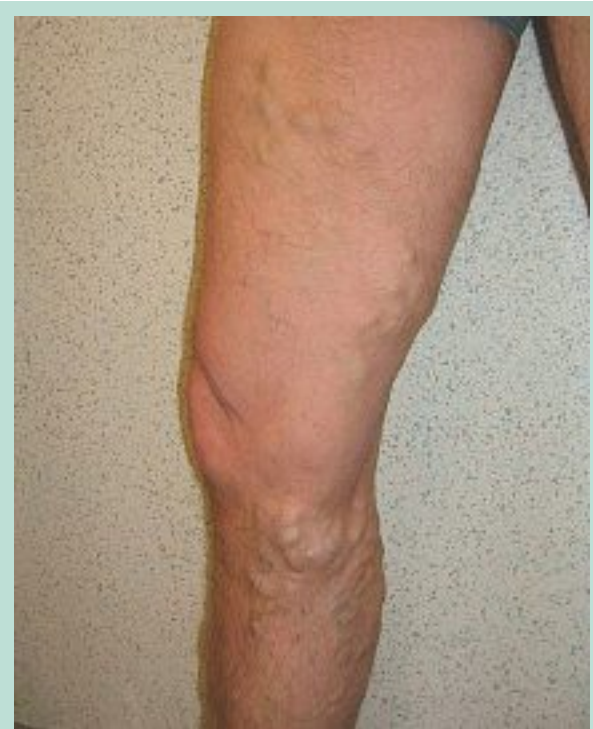
FIGURE 6 : Patient operated on 12 years earlier (high ligation and stripping of the great saphenous veins + phlebectomies) by one of the authors (MDM). Recurrent varicose veins due to neovascularisation at the saphenofemoral junction reconnecting with the anterior accessory saphenous vein and extensive varicose tributaries.

After initial stripping of the SSV to mid-calf level, neovascularisation at the SPJ may result in formation of new tortuous veins running from the popliteal fossa downwards, either in the saphenous compartment of the SSV ( Figure 3 ) or as superficial veins in the calf.