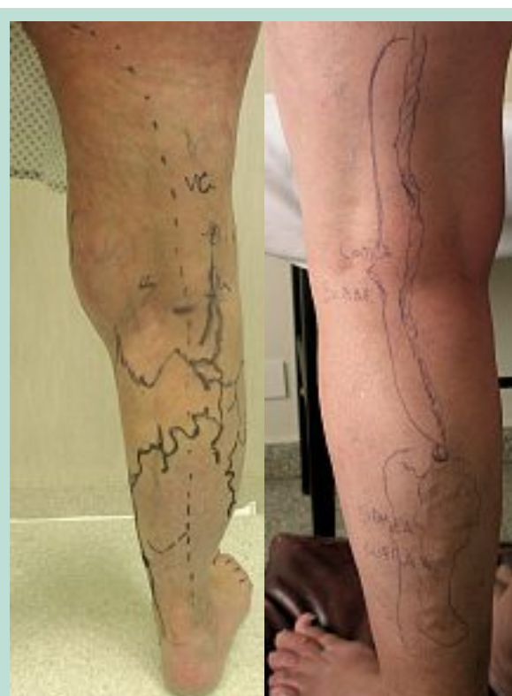
FIGURE 5 : Left: clinical preoperative manifestation showing varicose veins of the sciatic nerve, accompanied of insufficient small saphenous vein and post-axial vein. Right: varicose veins of the sciatic nerve. The upper section is sub-aponeurotic and the lower section is supra-aponeurotic.

Interestingly there is no further description of varicose veins in the internal popliteal sciatic nerve, probably due to the permanent depth at which this nerve is in the leg.