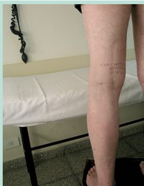
FIGURE 12 : Postoperative of 10 months.

Facing reflux as consequence of insufficiency of inferior ischial or gluteal veins a selective embolization according to the magnitude can be proposed.