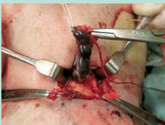
FIGURE 11 : Extirpation of sciatic vein.

Care must be taken in the therapy of the branch around the fibular head to avoid injury to the peroneal sheath of the external popliteal sciatic.